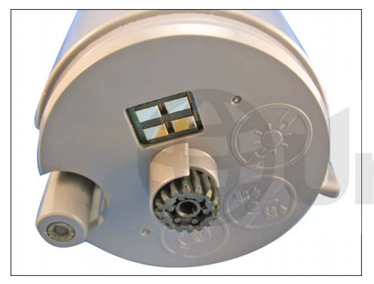
3. Gear side of cartridge with OEM chip.