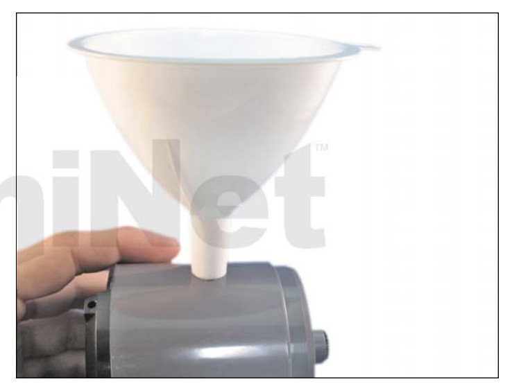
9. Insert a funnel through the hole. Be sure to shake the toner bottle well before opening. Pour the appropriate amount of toner via the funnel.

8. Clean the inside of the cartridge thoroughly using compressed air or a vacuum. With a half -inch hole, it would be much easier to just vacuum it out and is much less messy. We always recommend using compressed air, but in tight situations like this, it's best to vacuum. A vacuum will also be better at getting any plastic shavings that may have fallen inside.