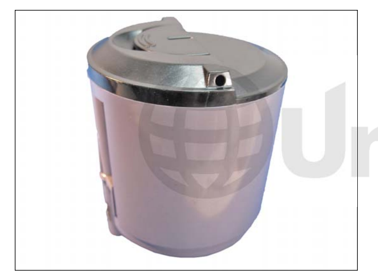
1. Samsung CLP-300 cartridge with front end cap.