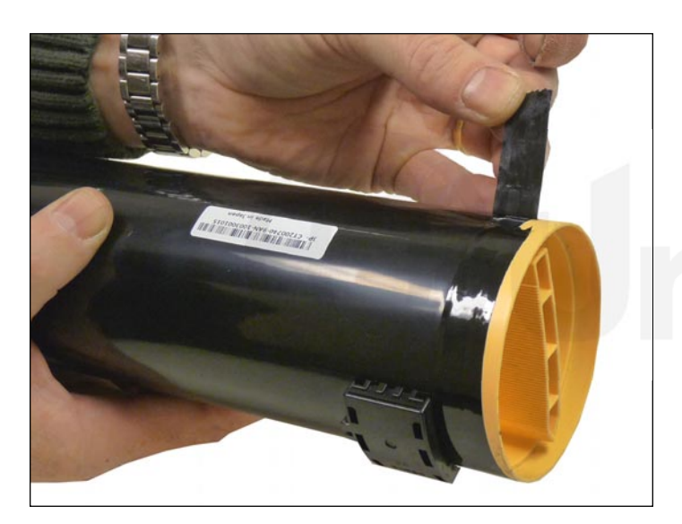
1. Remove the tape from the colored end cap.

The Phaser 7760 cartridges are rated for 32,000 pages Black and 25,000 Color. The OEM numbers are 106R01163 Black, 106R01160 Cyan, 106R01161 Magenta, and 106R01162 Yellow. There is a chip that must be replaced every cycle.