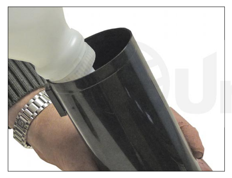
3. Vacuum the tube clean and fill with new toner for use in Phaser 7760.