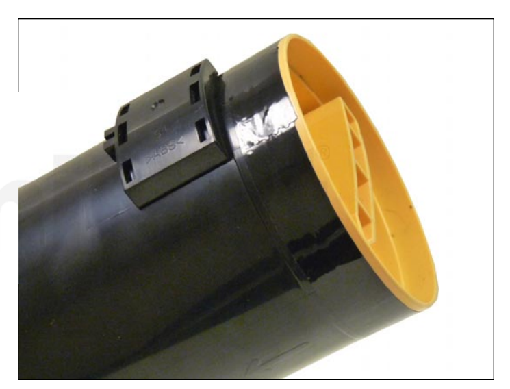
4. Replace the end cap. Replace the tape.