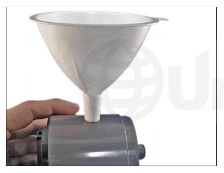
3. Insert a small funnel into the hole.