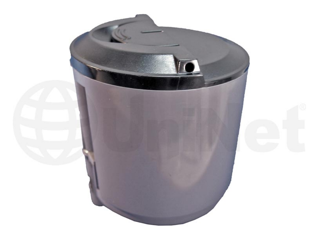
SAMSUNG CLP-300 TONER CARTRIDGE