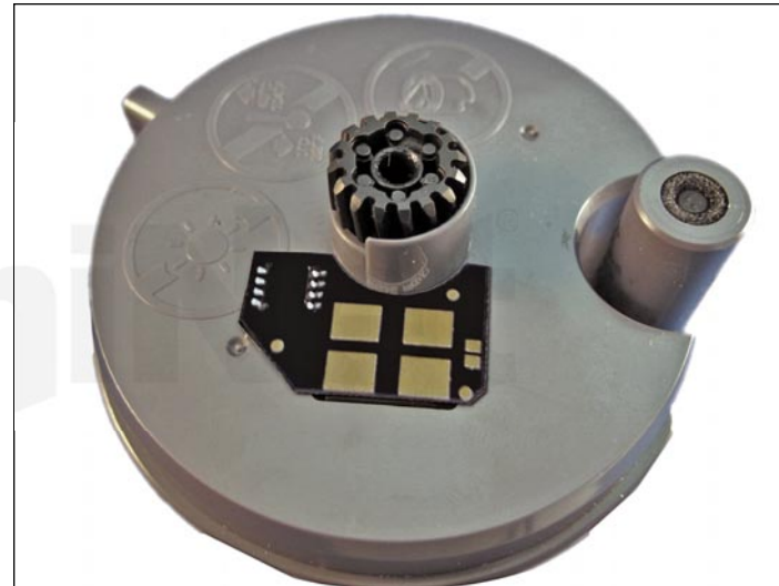
5. The OEM chip is not removed. A new chip is placed over it.

Peel off the adhesive backing on the chip and place it over the OEM.