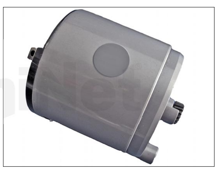
4. Cover the hole using a small piece of tape. Make sure the seal is tight and that there are no leaks. Also make sure the tape/label does not extend to the top of the cartridge as it is installed, this area has a very tight fit and the seal may be torn off as the cartridge is installed.