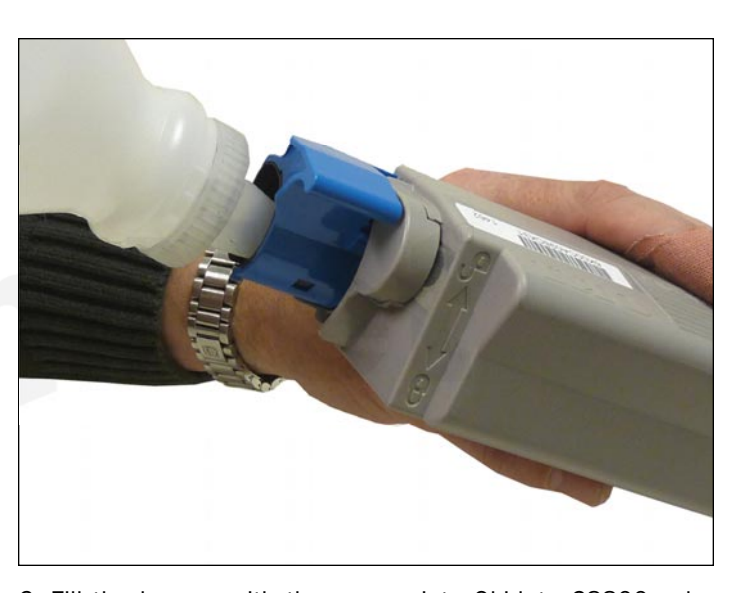
6. Fill the hopper with the appropriate Okidata C8800 color toner. Replace the fill plug.