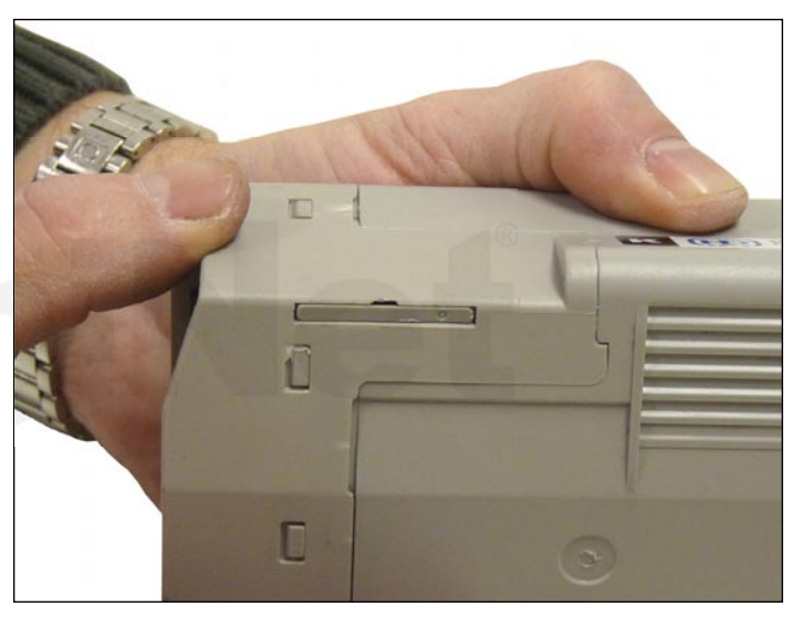
9. Snap the chip cover back in place.