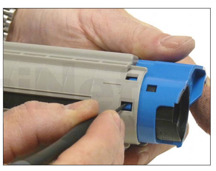
2. Press down on the locking tab of the blue handle. Rotate the handle to open the toner port. Vacuum/blow out any remaining toner.