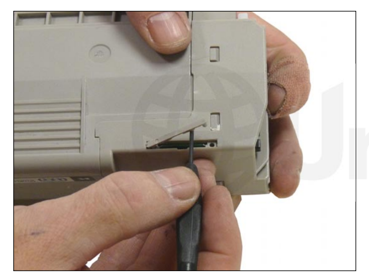
7. Carefully pry-up the chip cover from the hopper. It is best to remove the end closest to the edge of the cartridge first to help prevent any damage to the cover tabs.