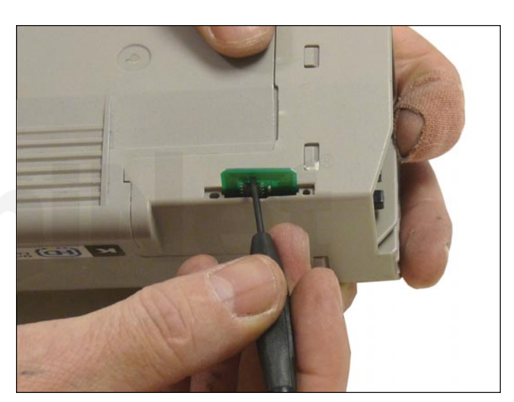
8. Remove the old chip and install the new. Be sure to keep the component side up when replacing the chip.