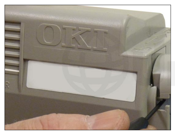
3. Carefully pry off the gear cover with a small jeweler's screwdriver.