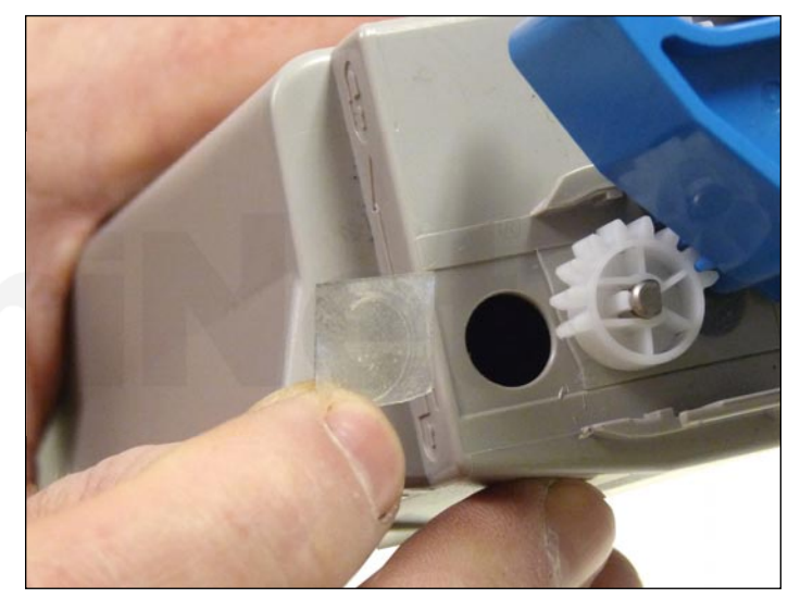
4. Cut the waste hopper seal just past the small white gear.

Remove the seal. Dump out the waste toner and vacuum/blow out any remaining toner.