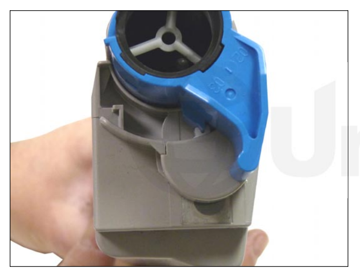
5. Replace the seal on the waste chamber. Install the gear cover and turn the blue handle so that the toner port is closed.