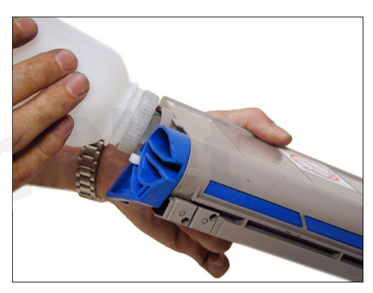
4. Close the port.

Fill with new toner and replace the fill plug.