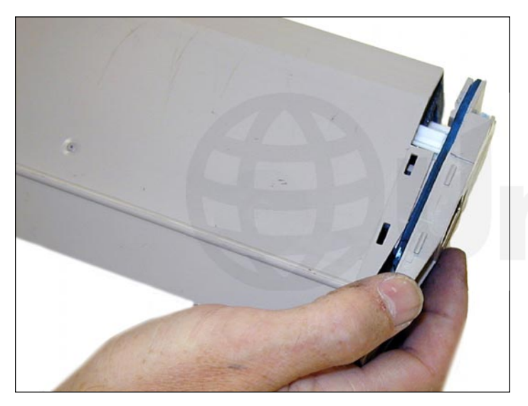
3. Start to snap the end cap back in place. As you press the end cap on, watch to make sure the mixing auger fits into the bushing and metal rod fit into their proper places.