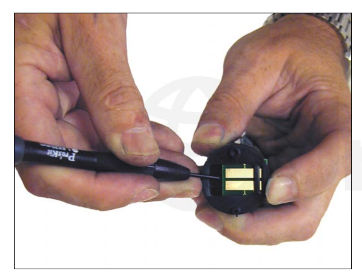
5. While pulling out on the top of the chip holder, slide the chip out with a small screwdriver. Replace the chip.