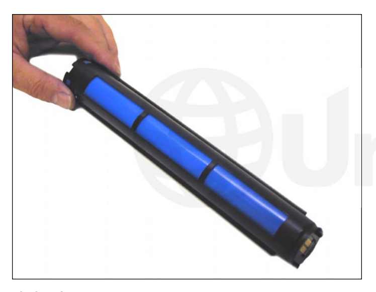
3. Carefully turn the blue handle so the toner port is closed.