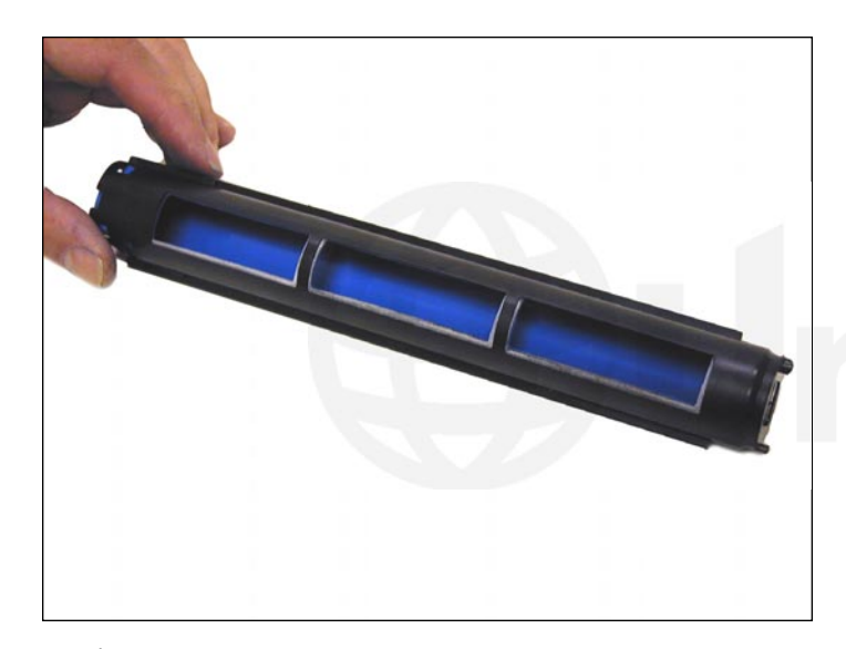
1. Turn the blue handle so that the toner port is open.

The Okidata B2200 toner cartridges are used in the B2200 and B2400 machines. They are rated for 2,000 pages at 5% coverage. There is a chip on the cartridge that must be replaced each cycle. The OEM cartridge part number is 4364030.