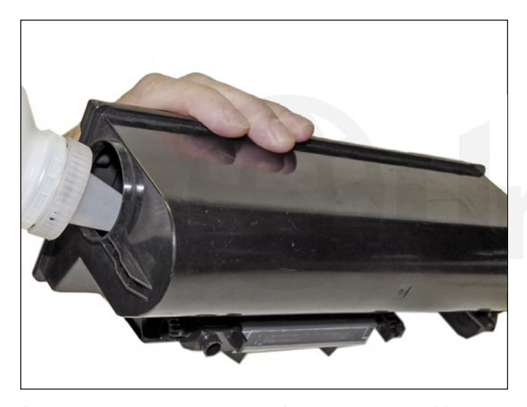
3. Fill the cartridge with toner for use in the TK-60 series of cartridges. Replace the fill plug.