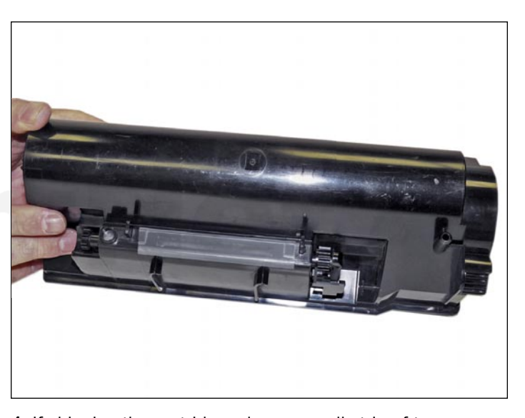
4. If shipping the cartridge, place a small strip of tape across the toner port.