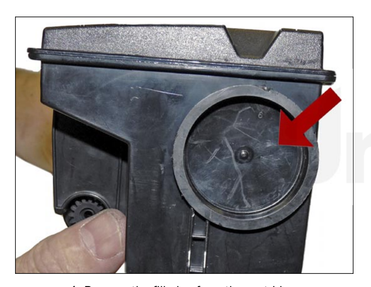
1. Remove the fill plug from the cartridge.

There is NO chip used on this cartridge.