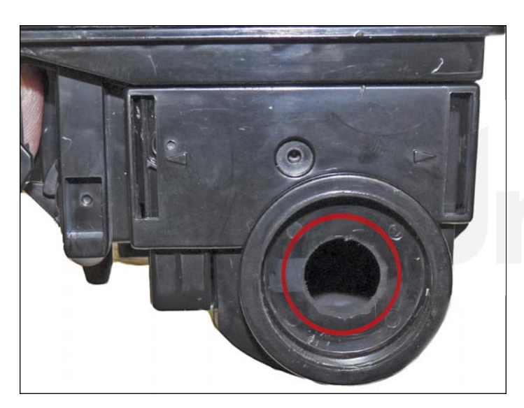
1. Drill a 1/2" to 3/4" hole into the fill plug.

There is a chip used on this cartridge that must be replaced each cycle.