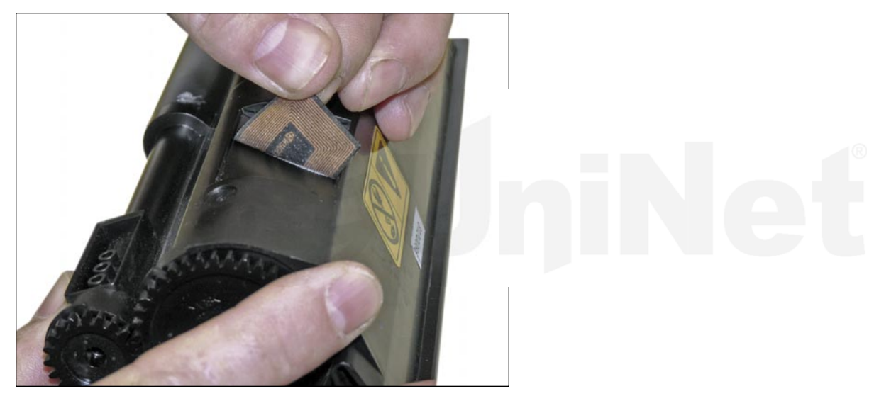
5. Peel off the old chip label (it is an RF type chip).