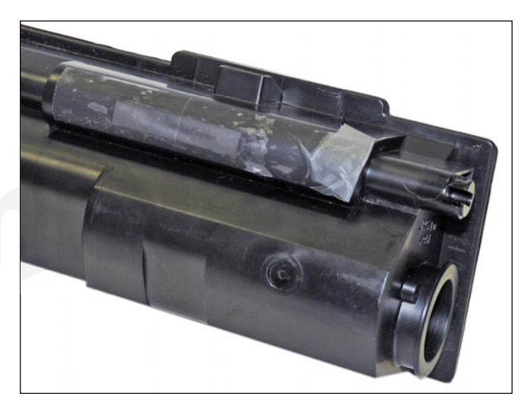
4. If shipping the cartridge, place a small strip of tape across the toner port.