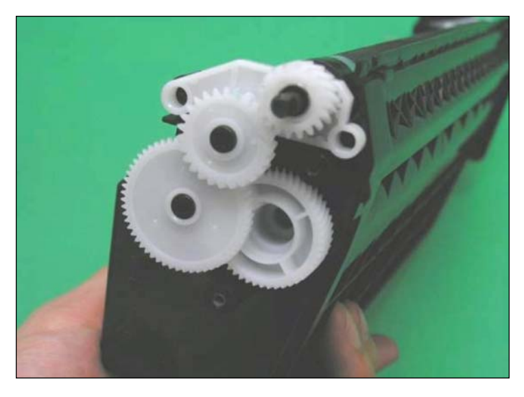
15. Install the Mag Roller as shown in the Hoper as shown in the photo. Then insert the Right Stabilizer, and all drive gears on the right side of the hopper.

The P2015 Left End Cap includes the Pull Tab feature like the OEM but does not include the orange clip. The orange clip is available separately or you can use the OEM orange clip Tighten all screws on the Left End Cap.