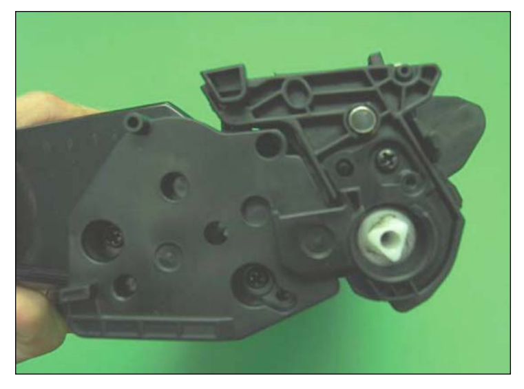
16. Install the P2015 Right End Cap on the right side of the Hopper. Tighten the 2 screws on the Right End Cap.