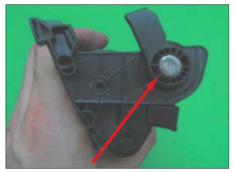
5. Insert the OPC Pin on the opposite side by pressing in.