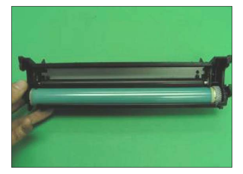
6. Assembled Waste Section.