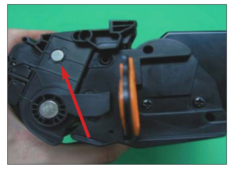
17. Assemble the Hopper side and Waste Hopper together and insert the hinge pin on each side to hold them together.