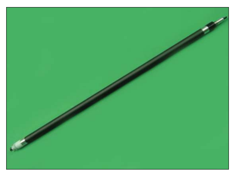
12. Place the Left/Right Mag Roller Bushing on each end of the Mag Roller.