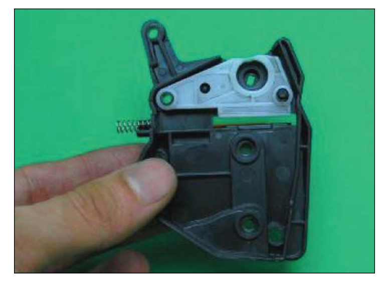
13. Install the Left Stabilizer on the P2015 Left End Cap as shown.