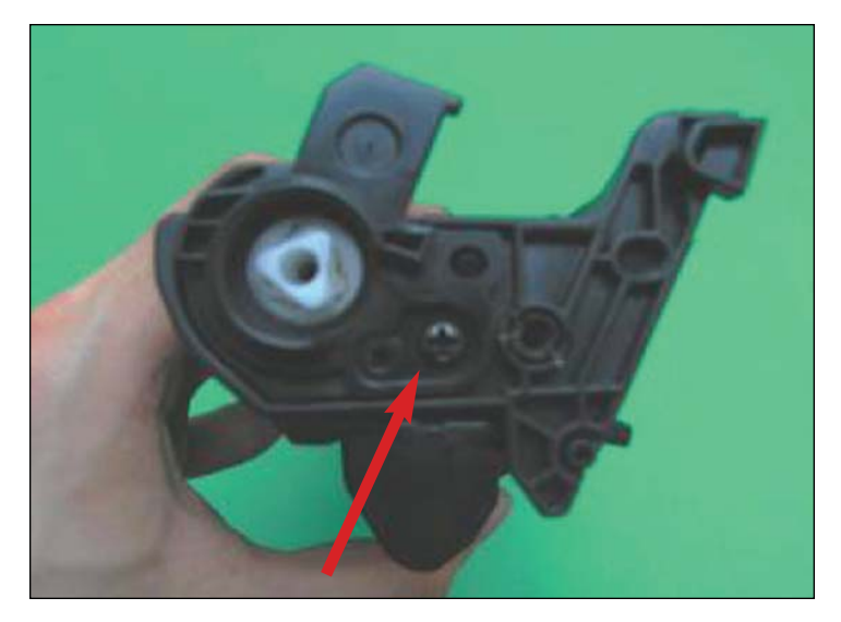
4. Attach the Bearing Plate with screws as shown.