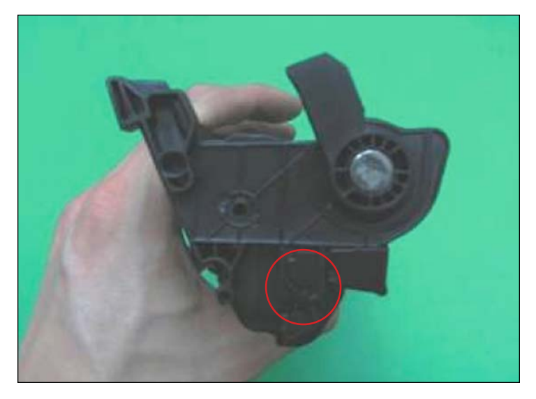
9. Insert the Trigger arm locking pin to fix the trigger in position.