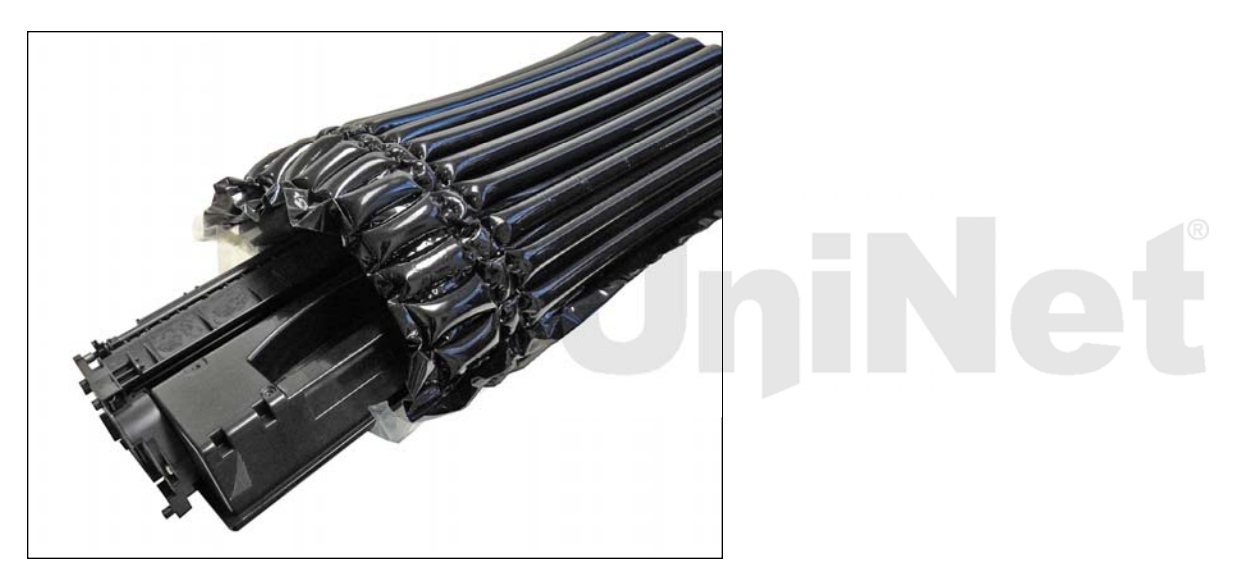
2. Insert the cartridge into the bag