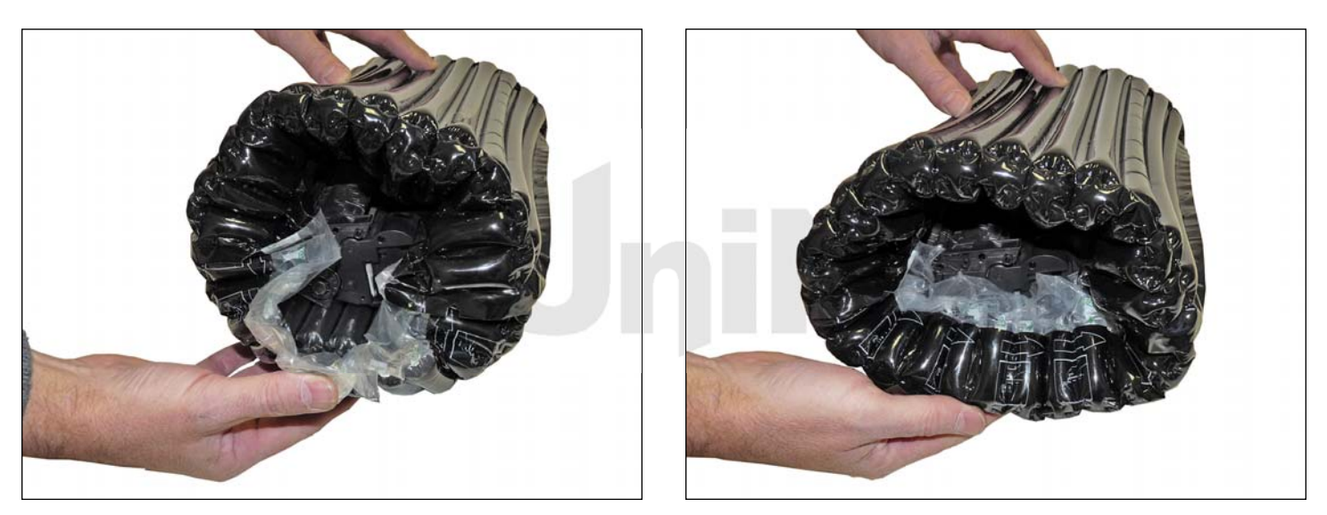
3. Hold the outer edge of the bag into the center of the bag to lock the cartridge in place.